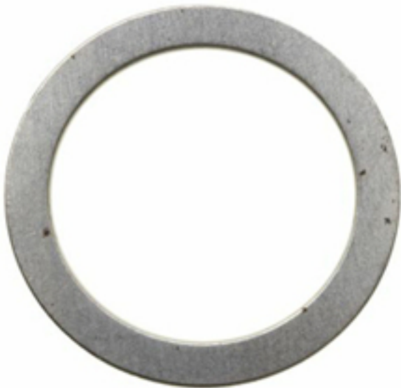
Spacer Shim Part # SU12931